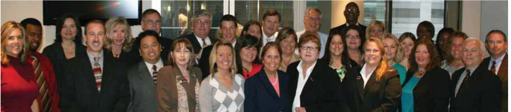
Staff in the lobby of the new office space on October 26